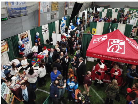
Pictured: Aerial view of the 2018 Business EXPO and Food Showcase